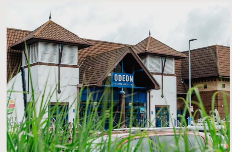
Port Solent Portsmouth