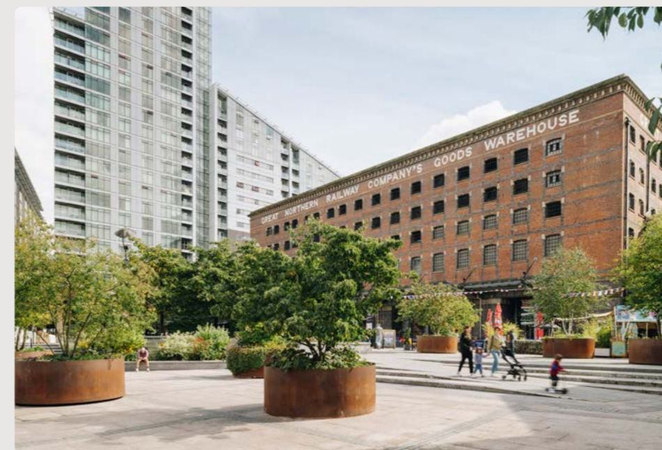
Great Northern Manchester