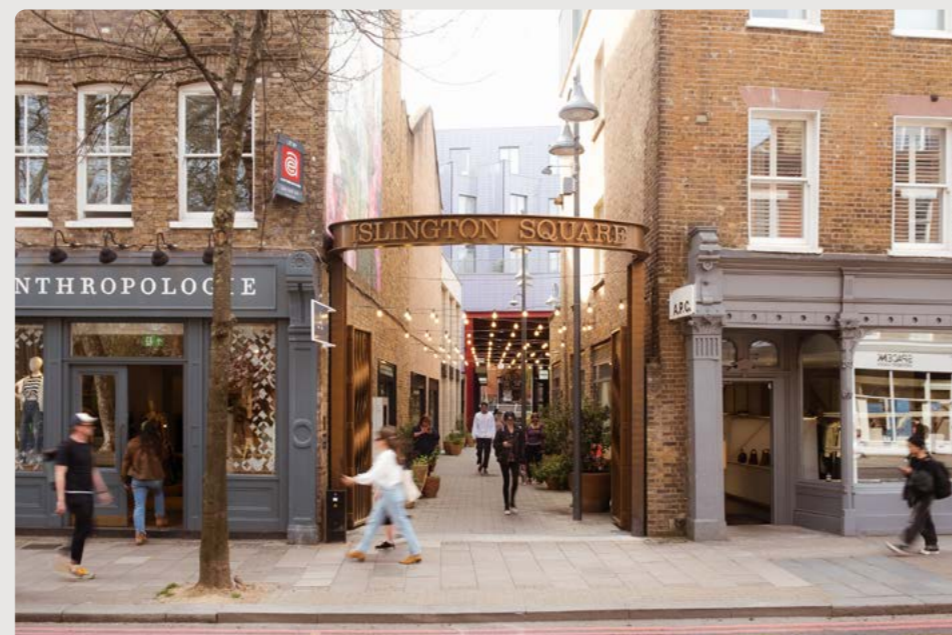
Islington Square London