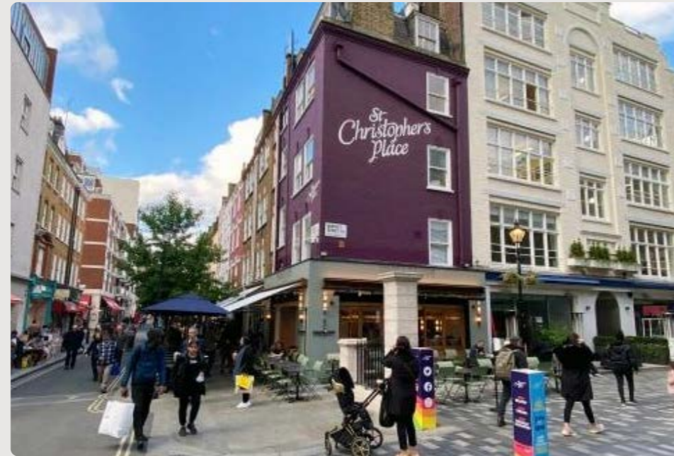
St Christopher's Place London