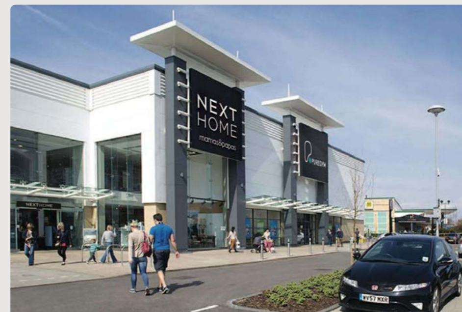
Brotherhood Shopping Park Peterborough