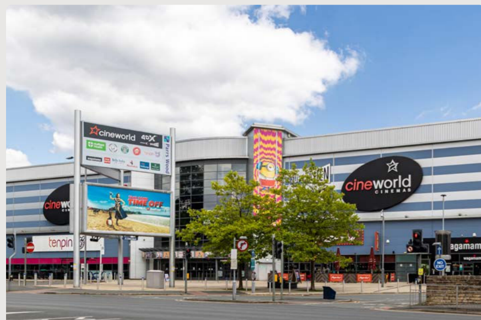
Parrs Wood Didsbury