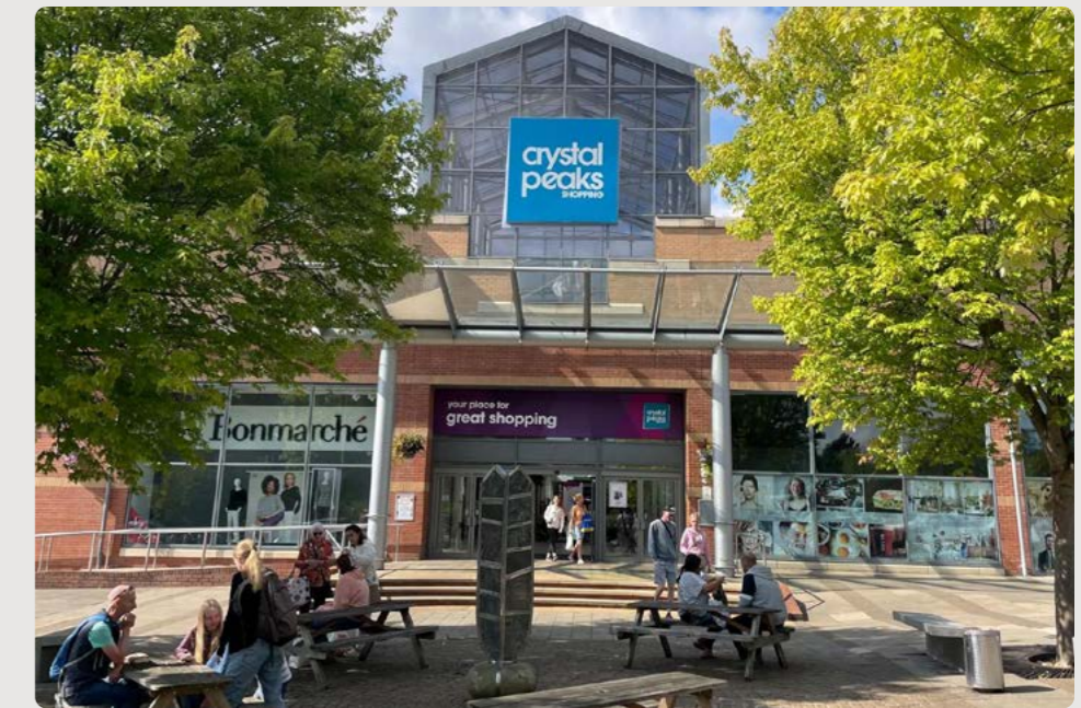
Crystal Peaks Sheffield