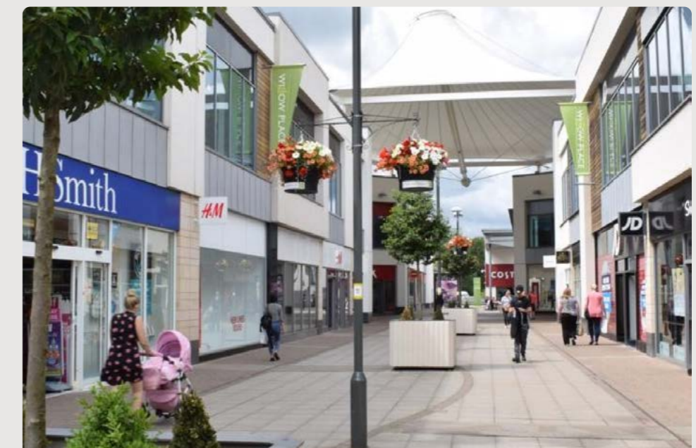
Willow Place Corby