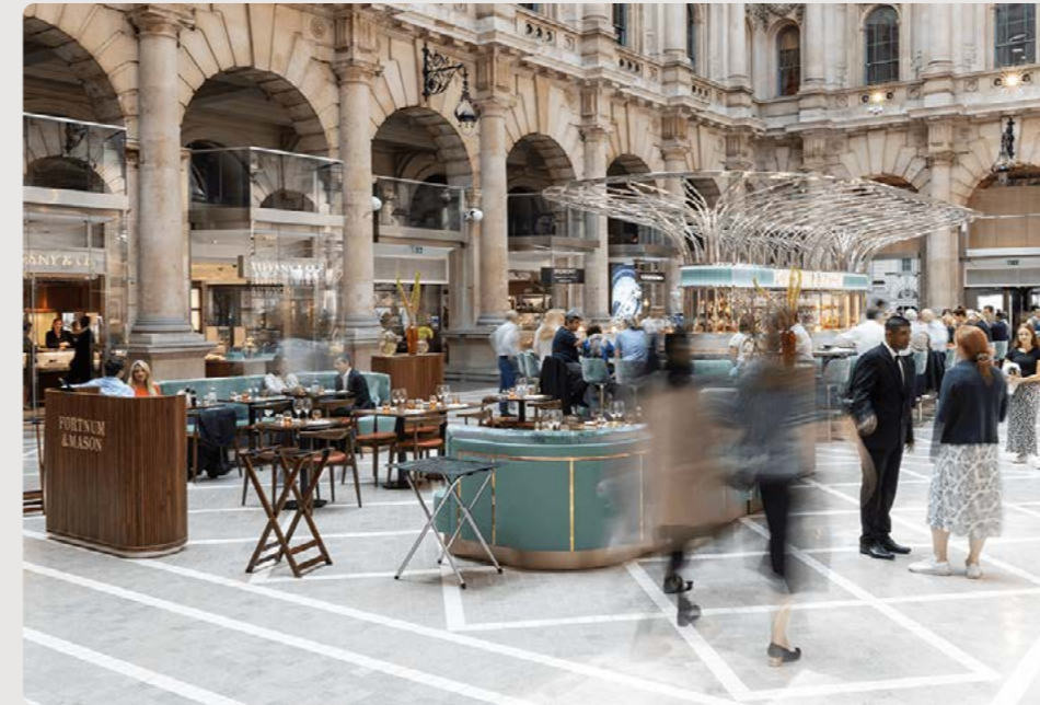
The Royal Exchange London