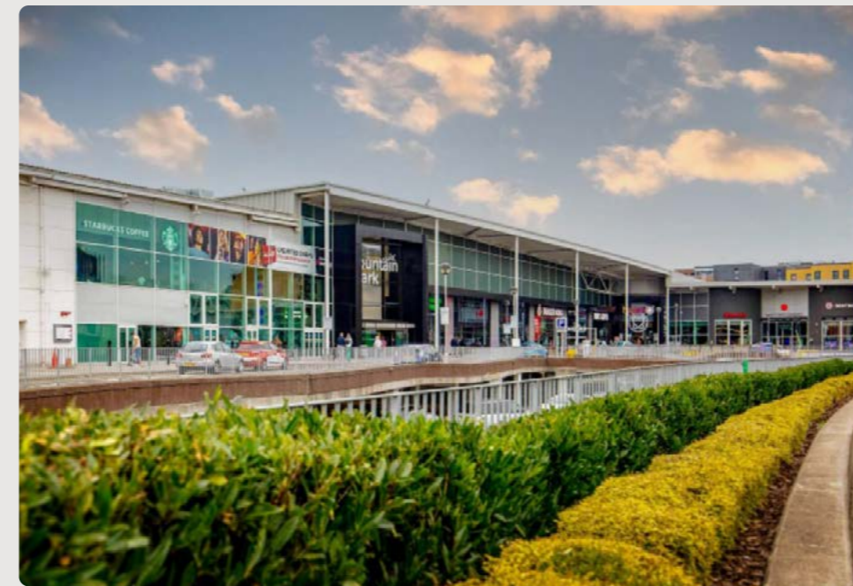
Fountain Park Edinburgh