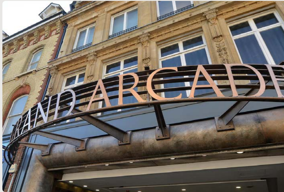
Grand Arcade Cambridge