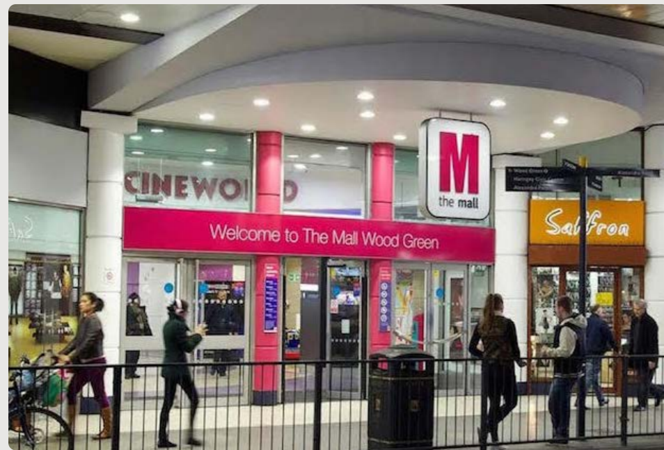
The Mall Wood Green