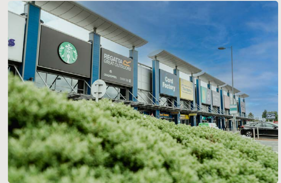
Manchester Fort Manchester